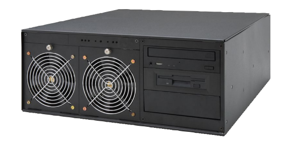
RMS420 Embedded Server